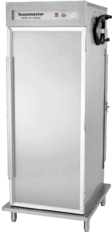
Shown with Optional Prison Package