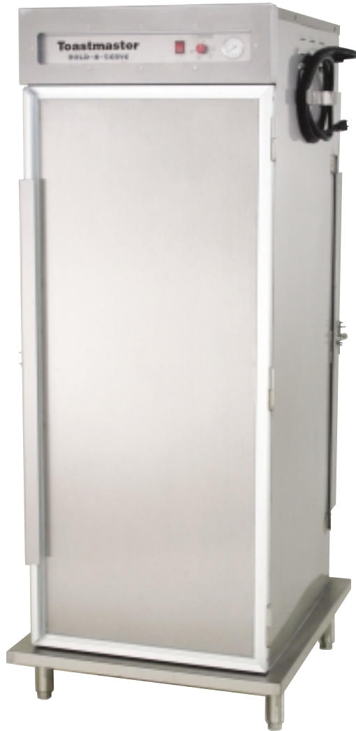
Shown with Optional Prison Package